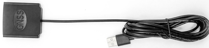
Figure 1: SKM55U-GPS Top View

It is based on the high performance features of the MediaTek single-chip architecture, Its -165\text{dBm} tracking sensitivity extends positioning coverage into place like urban canyons and dense foliage environment where the GPS was not possible before. The UART and USB connector design is the easiest and convenient solution to communication with other electronic equipment.