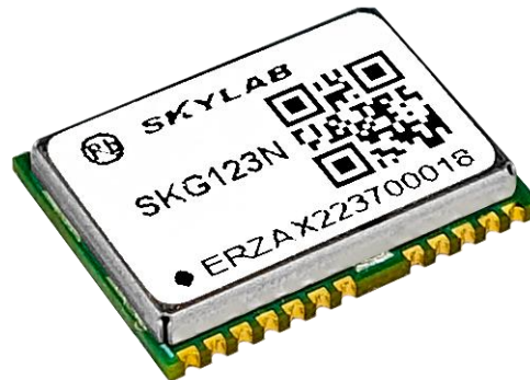
图 1: SKG123N 正视图/Top view