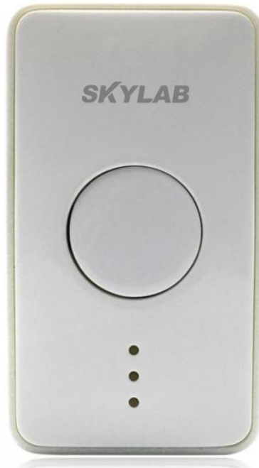
Figure 1 F206 Product picture

This product is based on LTE / GPRS network and GPS satellite positioning system. It is the most technologically advanced dual positioning of GPS and AGPS. IPX-68 waterproof professional is designed for individuals and hound. A new pet tracker and activity state 4G GPS locator for pets.