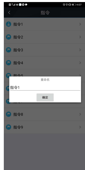
Long press rename instruction name