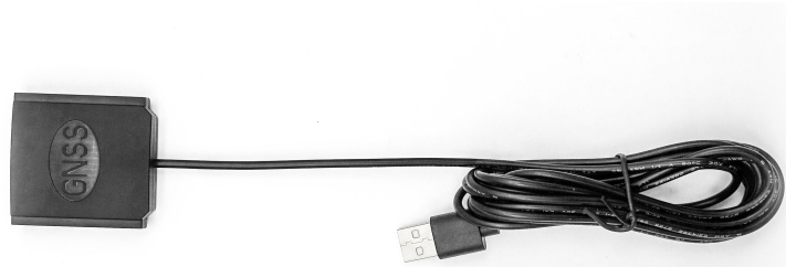
Figure 1: SKM55U-3GB Top View

It is based on the high performance single-chip architecture, Its -165\text{dBm} tracking sensitivity extends positioning coverage into place like urban canyons and dense foliage environment where the BD/GPS was not possible before. The UART connector design is the easiest and convenient solution to communication with other electronic equipment.